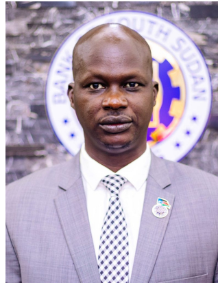
1st Deputy Governor of BoSS Hon. Addis Ababa